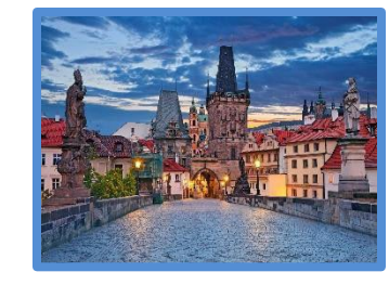
PRAGUE, CZECH REPUBLIC

PASSPORTS: AT SIGN-UP, SUBMIT A COPY OF THE FIRST PAGE OF YOUR PASSPORT WHICH SHOWS YOUR PICTURE, PASSPORT NUMBER, DATE OF BIRTH, ETC. WITH YOUR TRIP APPLICATION. Passports must be valid for 6 months after the trip return date.